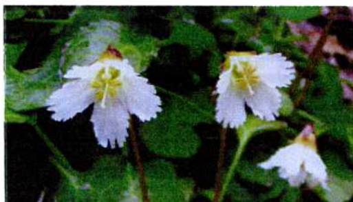
Shortia galacifolia "the Oconee Bell"